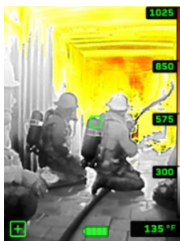
FIRE MODE Using TI BASIC+ (With Spot Temp)