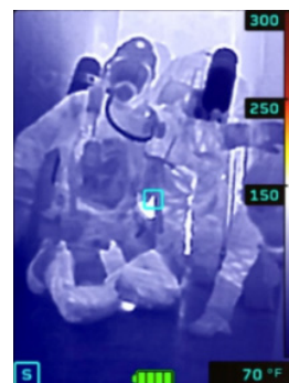
SURVEY MODE With Spot Temp

www.frsa.com.au | admin@frsa.com.au | + 61 7 3209 7422